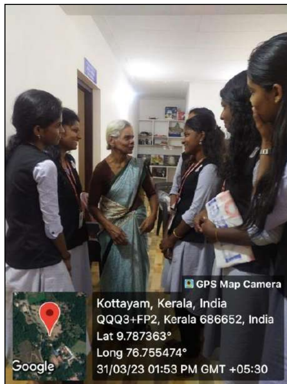
Students engaging in conversation with an elderly woman