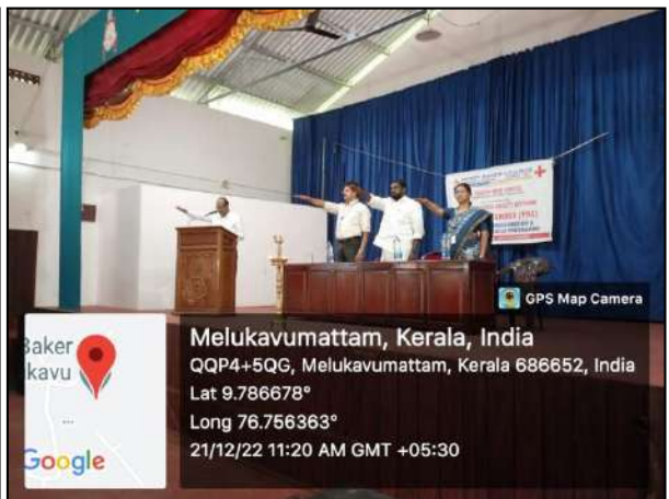
Taking YRC Pledge